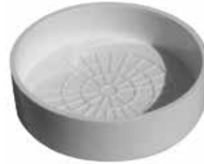
End Cap PVC