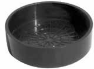
End Cap ABS